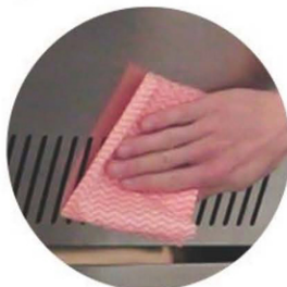
Cleaning fume hood